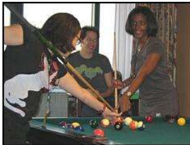
Associate members enjoying a game of pool at ASP -2008.

He will be accepting this award at a presentation ceremony held during the College's 2008 Homecoming Weekend's Alumni Awards Reception/Dinner. This event will be held on Friday, October 10, 2008 starting at 6:30 p.m. at the Stone Creek Country Club, Urbana IL.